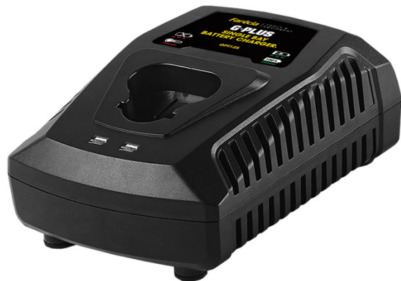
G PLUS MINI BATTERY CHARGER for GPT125